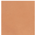
Aged Camel Full-Grain Leather