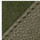
Deep Green Velvet/Full-Grain Leather