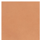
Aged Camel Full-Grain Leather