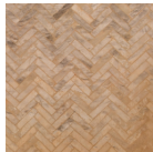
Smoked Herringbone Capiz PP