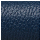
Navy Full-Grain Leather PP