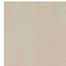
Light Gray Full Grain Leather PP