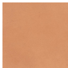
Aged Camel Full-Grain Leather