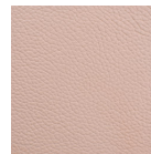
Dusty Rose Full-Grain Leather