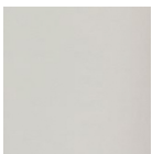
Light Gray Full-Grain Leather